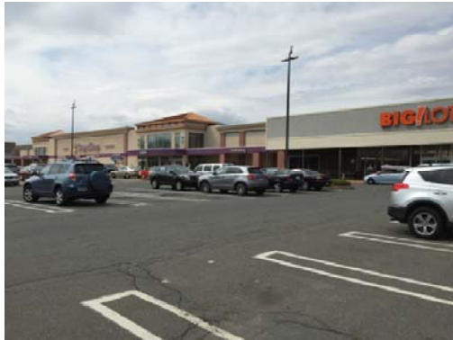
Neighborhood Shopping Center